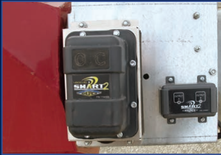
Manual controls for Wheel Motor and Optional Light Kit