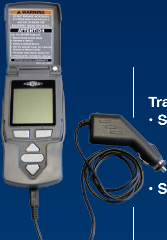
SMART2™ Transmitter for Remote Control shown with charging cradle

(Photo Shown without Motor Cover for Clarity)